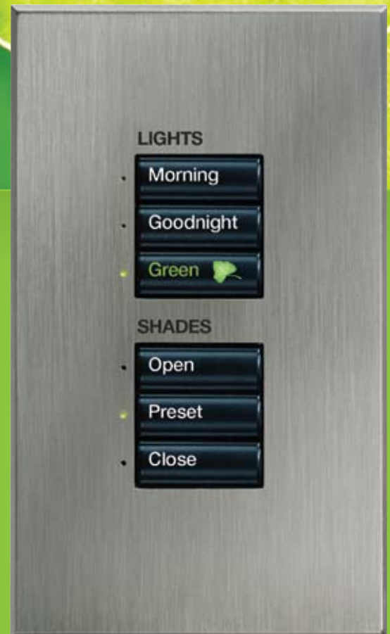
New! seeTouch® keypad with green setback function

We now offer Vacation Mode Trim, which can be programmed to trim back lighting by an added amount—reducing energy use. It also allows playback of lighting events that happen only at night.