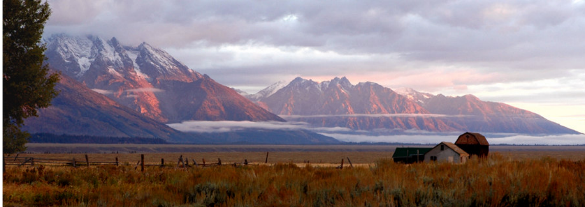
North Barn – Grand Teton National Park